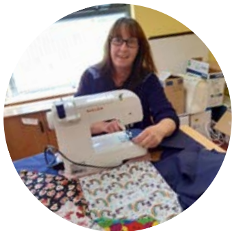
Mask making as part of the Face Mask Project

The Traveller Development worker along with Shannonside Women's Group made and dispatched the masks following Covid safety guidelines. Masks were divided into packages and delivered to each family in the Traveller Community in Leitrim.