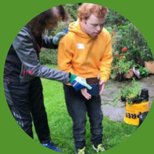
Participant attending a placement, pre pandemic

Social farming activity takes place in a safe and supportive environment taking into account an individual's abilities, desires and interests. Focus remains on encouraging participants to socialise, gain confidence and build relationships.