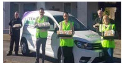
RSS & Tús Participants supporting Drumsna Meals on Wheels during Covid-19

47% Progression rate into employment or education