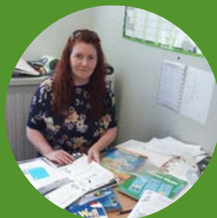
Preparation of resource packs for the children who would have attended the Early Years' Service

In 2009 our purpose-built Community Centre in Carrick on Shannon opened its doors providing a permanent base for the Leitrim Travellers Project with Mohill and the rest of the county as outreach.