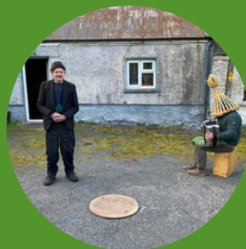
Mummers Project, visiting the elderly and isolated during Christmas 2020

The Feel Good Clubs & Active Age Groups are social gatherings for people aged 55 and over, who want to remain active and involved into their retirement.