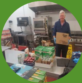
Preparation of The Food Cloud parcels

Leitrim Development Company managed its first Employment Programme in 1997 with 11 Participants and one Supervisor. Twenty three years on, there are now 5 Schemes, 289 Participants, 13 Supervisors and over 230 Community Groups and Childcare Facilities.