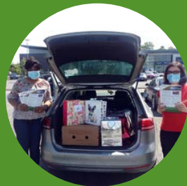
Delivery of COVID-19 Response Newsletter to the community

SICAP aims to address high and persistent levels of deprivation through targeted and innovative, locally-led approaches. It targets and supports those who are disadvantaged in Irish society and less likely to use mainstream services.