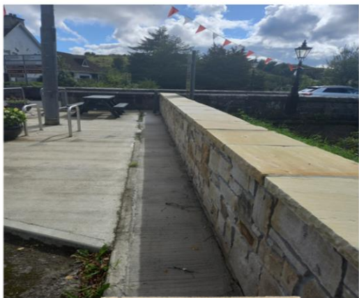
Dowra Rest Stop