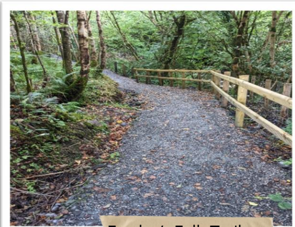
Fowley's Falls Trail