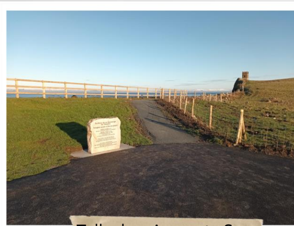
Tullaghan Access to Sea