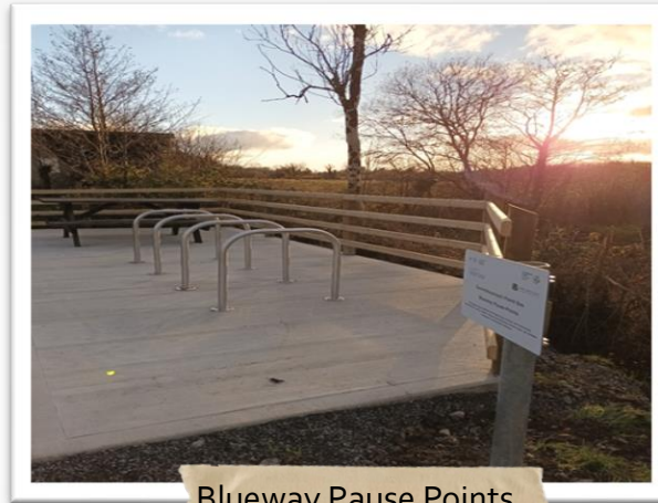
Blueway Pause Points