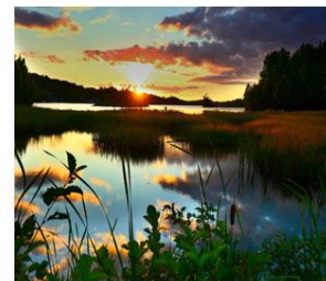
Local Climate & Environmental Action