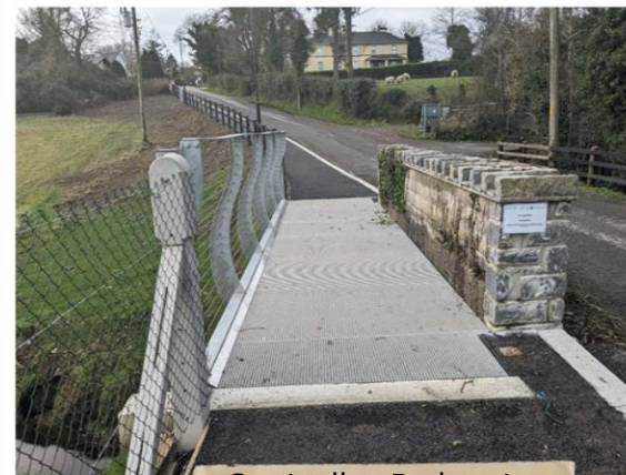
Carrigallen Pedestrian Bridge