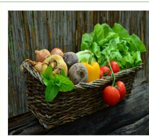
Food & Waste