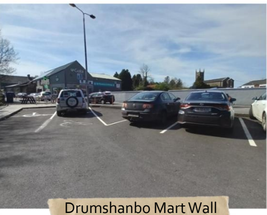
Drumshanbo Mart Wall & Carpark