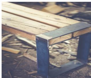
Shopping & Recycling