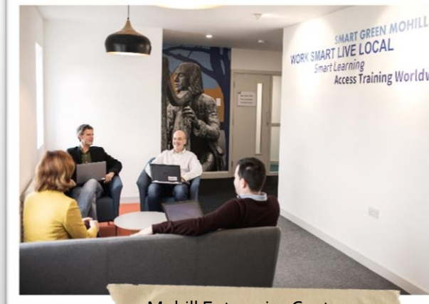
Mohill Enterprise Centre