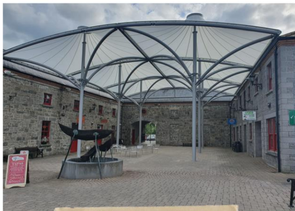
Market Yard Canopy