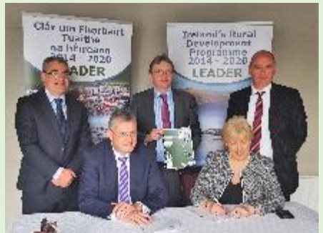
Signing of the contract to deliver the LEADER programme by Leitrim Local Community Development Committee and Partners.

This handbook is for any group, business or individual wishing to apply for LEADER funding. It will give you an overview of the LEADER Programme in County Leitrim and the various plans and partners involved in the programme. It will also give you information on who can apply, the types of projects which are eligible for funding and the rates of funding available. It is important that you read this booklet in full in order to understand the process to be followed if you are interested in applying for LEADER funding in County Leitrim.