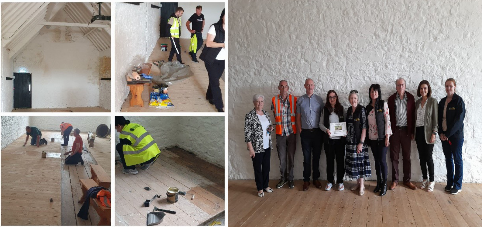
Proudly supporting our local groups including The Attic Memorial, Carrick on Shannon