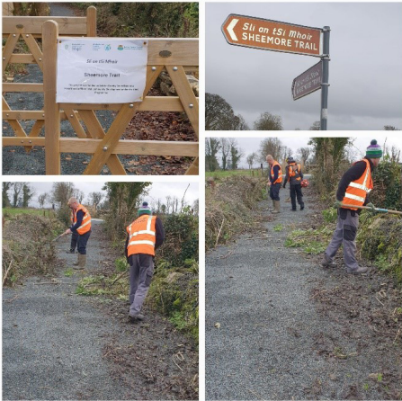
Walking Trail at Sheemore