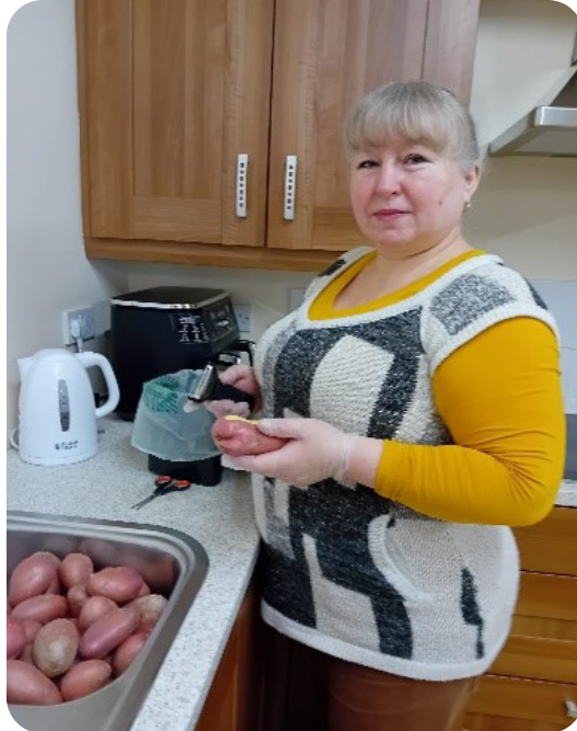
Cullinary support at Rosebank Community Centre & Crèche

Eligible clients must be getting an eligible Social Welfare payment for at least 12 months. Individuals can contact their local Social Welfare office to confirm eligibility and to be referred for a placement. Vacancies on CE are available to view on Jobs Ireland.