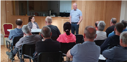
An annual safety induction with our team