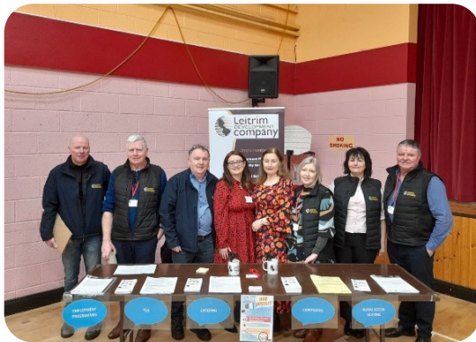
Employment Programme Team

Would you like to get back into employment? We have vacancies in Childcare, Environmental, Heritage and Administration. Consider joining our team.