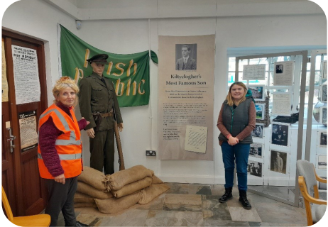
Our Tour Guide providing a tour of Kiltyclogher Heritage Centre