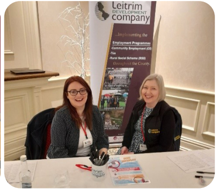
Engaging with clients at our Recruitment Fairs