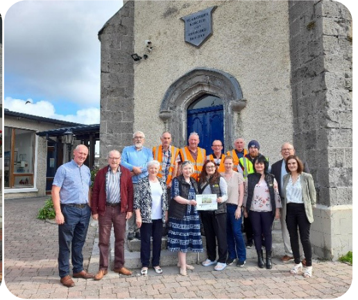
St. George's, Carrick on Shannon